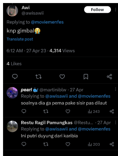
Figure 4 Comment

The next comment came from the @alpenliben account, criticizing the racism towards Princess Ariel in The Little Mermaid Live-action . This comment received eight responses with 74 retweets and was liked by 1,781 people. The comments contain harsh criticism of Princess Ariel's skin color, which, according to the @alpenliben account, makes no sense because Princess Ariel has black skin because Ariel's white skin has been embedded in their memory. Disney's live-action depiction was deemed inconsistent with the animated version. Audiences hope that Disney presents what they present in animation and does not need to change Princess Ariel's skin color to black.