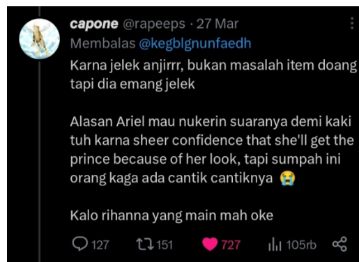
Figure 1 Comment

A number of controversial opinions then gave rise to a phenomenon that contains several questions. Are the comments, actions, and reactions of the audience simply because they are disappointed with the replacement of the main character or because there are other elements, such as issues of racism? Racism is the differential treatment of individuals based on skin color, ethnicity, race, and background, and this limits or violates individual rights and freedoms. (Amnesty, 2021). Many comments circulating on Twitter contain racist sentences such as the following.