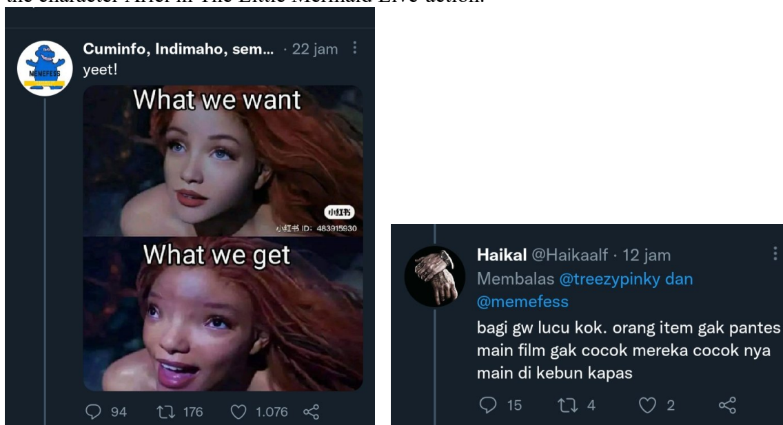
Figure 5 Comment

Apart from comments regarding the physical appearance of the actor Ariel, Twitter users also commented on one of the photos posted on the Automatic Fanpage (autobase), @memefess, a photo with the caption "What we want" on a photo of a black person and "What we get" on a photo of the actor Ariel ( Halle Bailey) received lots of comments and likes from Twitter users. In the photo, there is a white person who they hope will play Ariel, while comments of disappointment are thrown at the photo with a black person, namely Hailey Bailey or the character Ariel in The Little Mermaid Live-action.