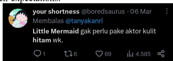
Figure 2 Comment

@rapeeps commented on the character Ariel, Halle Bailey, in the film The Little Mermaid, that she was not worthy of playing the main character because she was ugly, black, and not beautiful. This insulting comment was responded to by 127 comments, retweeted 151 times, and liked by 727 people. We found many similar opinions that perceived the character Ariel as not meeting their expectations.